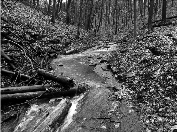
Come for a relaxing hike on the Neal Thorpe Trail in the cool ravines and woodlands.