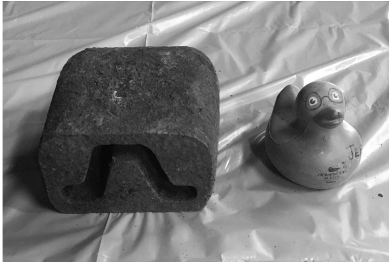
What is this heavy iron relic used for? (Duck for scale)